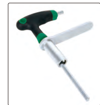
torque adjustment tool (optional)